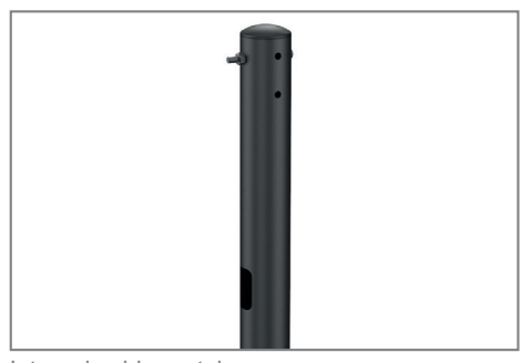
Internal cable routeing