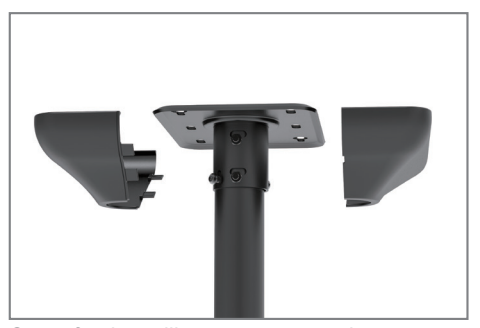
Cover for the ceiling screw connection